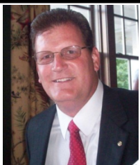
Nation Ford Land Trust Executive Director

210 Tom Hall Street Fort Mill, SC 29715 Phone (803) 547-8140 Fax (803) 547-2852