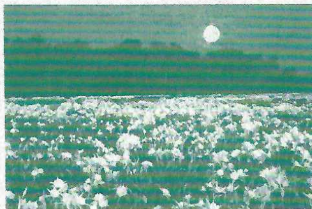
"Rocky Shoals Spider Lily - Full Flower Moon"

Sales of the Rocky Shoals Spider Lily prints have been excellent. This photo was taken at Landsford Shoals of the Catawba River, South Carolina during a full moon in May 1999. The Rocky Shoals Spider Lily ( Hymenocallis coronaria ) is a rare plant which inhabits shoals in Piedmont rivers in the Southeast. The population at Landsford is believed to be the largest in the world.